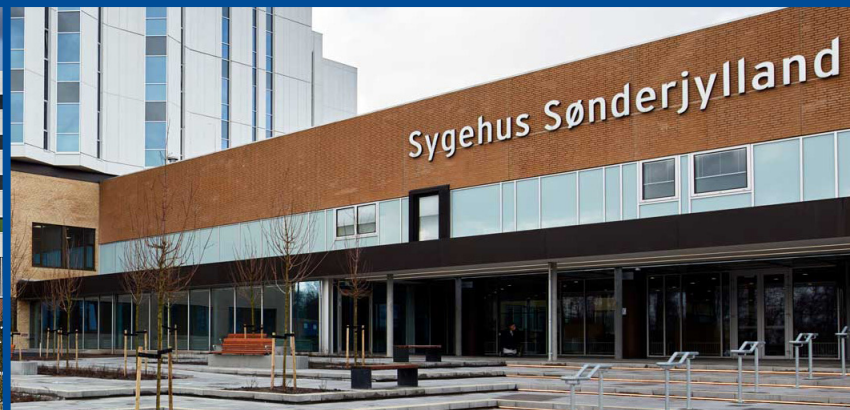
Aabenraa Hospital, Denmark