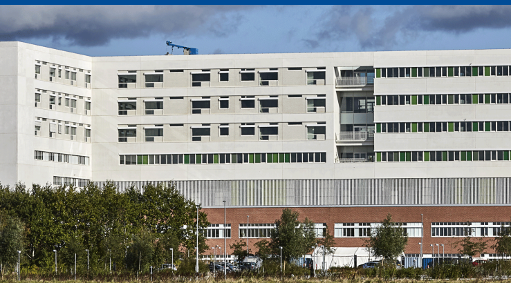
University Hospital, Aalborg Denmark