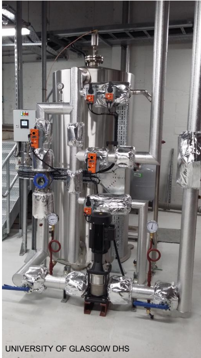
UNIVERSITY OF GLASGOW DHS

Reliably treating over 3,500,000 litres of closed system water across the UK