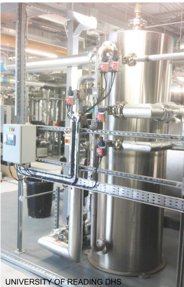
UNIVERSITY OF READING DHS